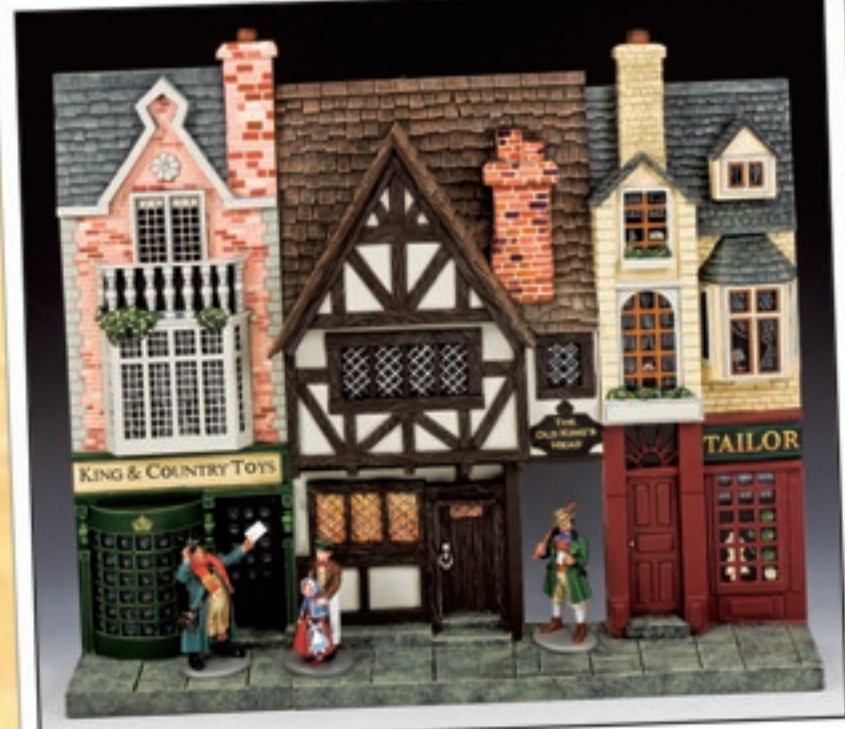
The Complete Dickens Street