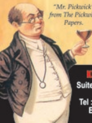
"Mr. Pickwick" from The Pickwick Papers .

soul of mid-Victorian England. He created a body of work whose appeal has endured till the present and is among the most loved of all time.