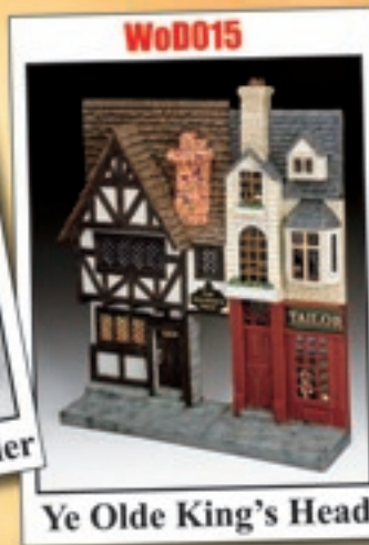
Ye Olde King's Head