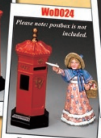
Posting A Letter