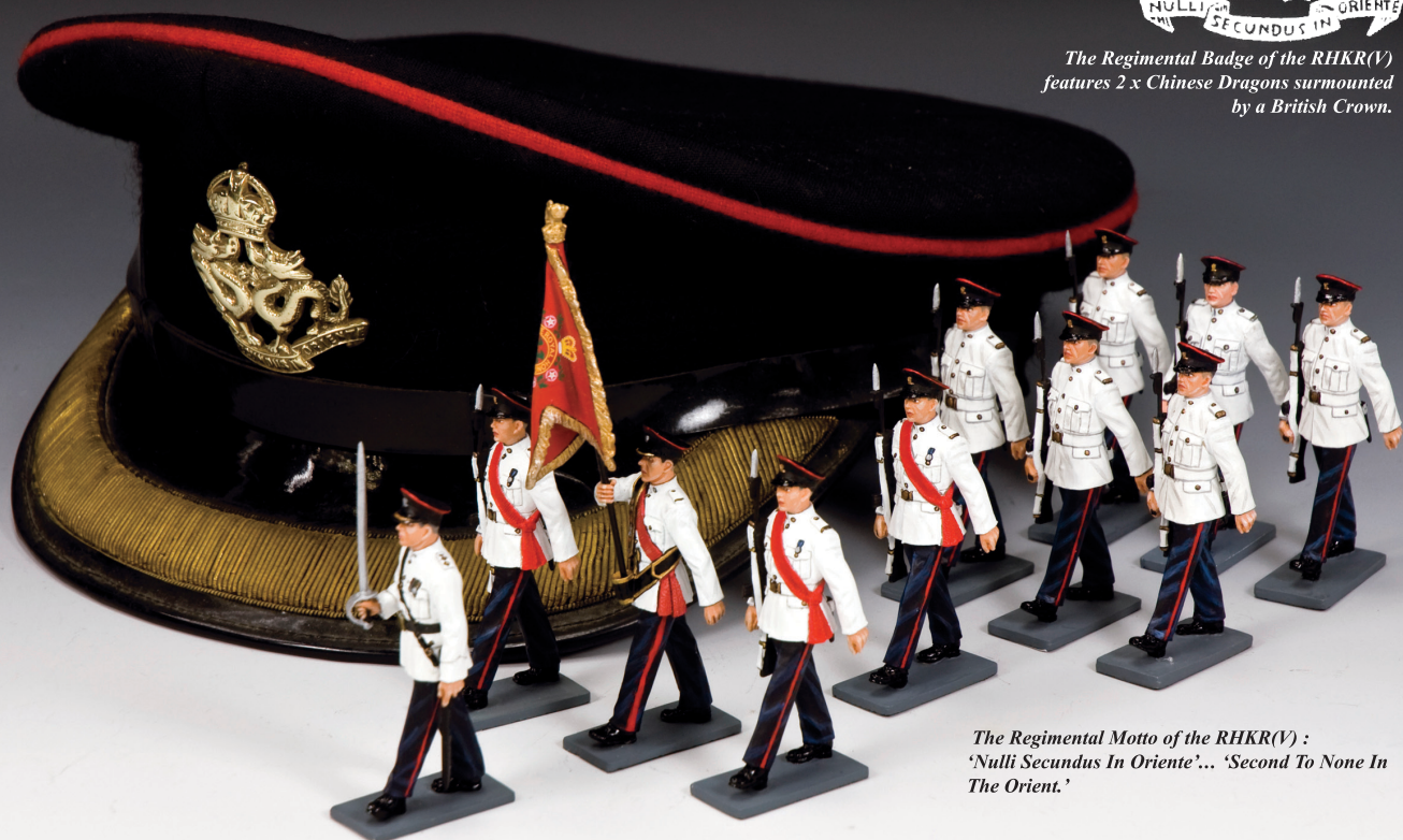
The Regimental Motto of the RHKR(V) : 'Nulli Secundus In Oriente'... 'Second To None In The Orient.'