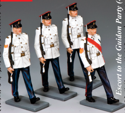
Escort to the Guidon Party (4)