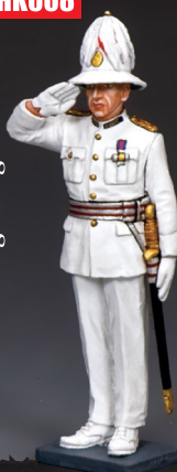
The Hong Kong Governor