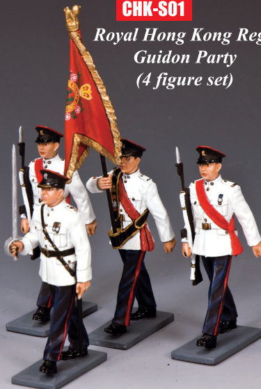
Royal Hong Kong Regt. Guidon Party (4 figure set)