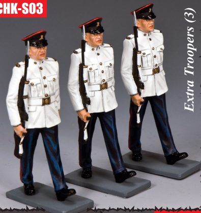
Extra Troopers (3)